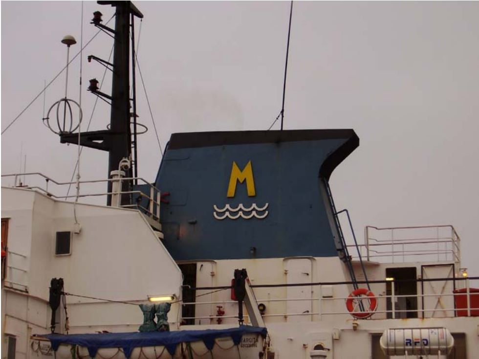
TSA TANKER SHIPPING

[< Previous 690 691 692 693 694 695 696 Next >]